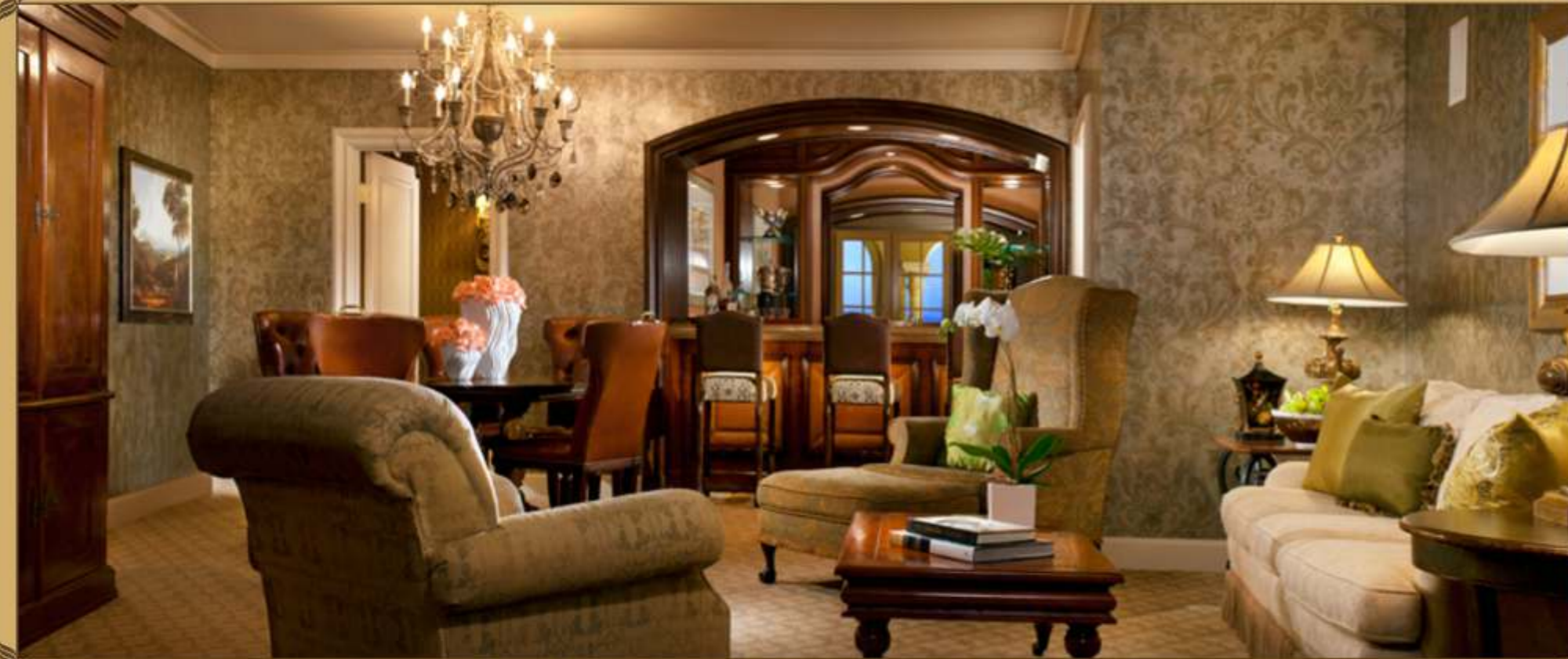
At Konark Sun City the Fascinating Arena Offers you the Perfect moments to Share your Emotions with Your Loved Ones