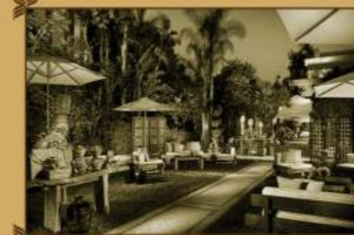
Outdoor Thematic Garden For Private Practice & Get Together