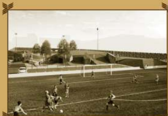
Multi Sports Ground