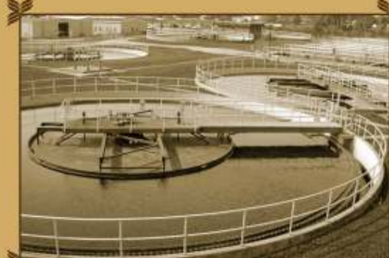
Sewage Treatment Plant (STP)