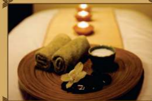
Unisex, Spa Facility