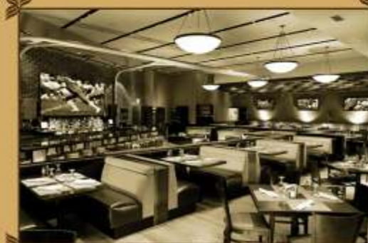
Fine Dine & Lounge Area