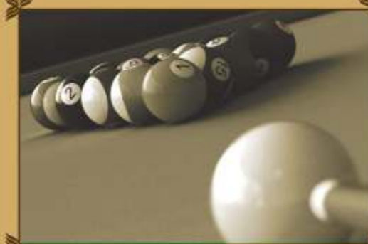
Indoor Game Area