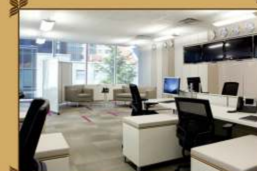
Plug & Play Office Facility