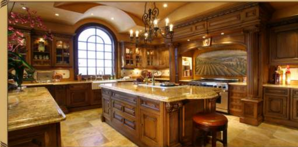
Cook your Favourite Food in your Desired kitchen Lifestyle that equipped Beautifully