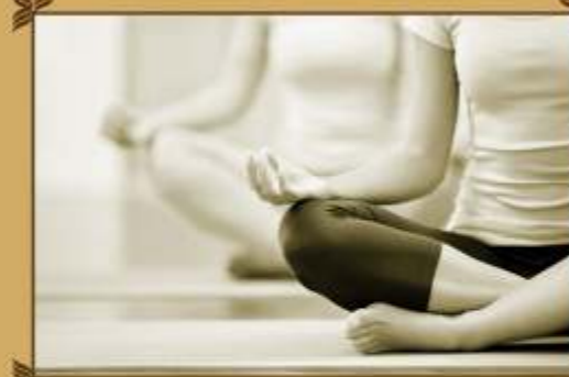
Meditation & Yoga Area