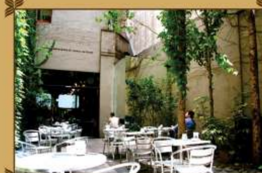
Outdoor Coffee Shop