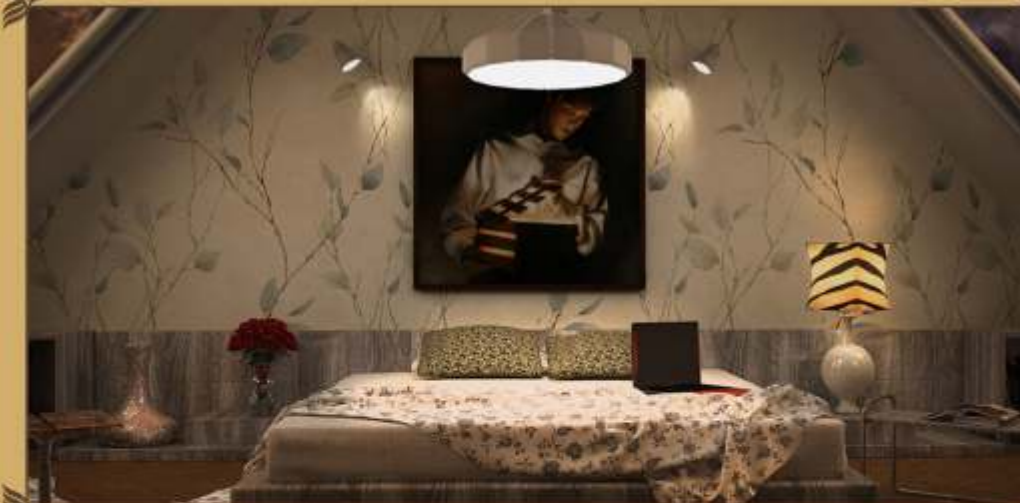
Here, the Zone of Cozy Ambience calling you to soothe your Body & Soul