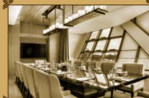
Business Meeting Zone